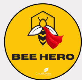
Sponsored A Hive