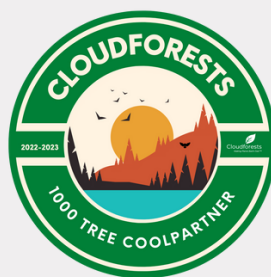
Planted 1000 Trees